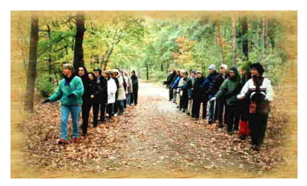
"Good walking leaves no track behind it." Lao Tzu, Tao Te Ching

For more information and visual demonstrations, visit: